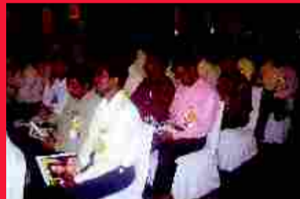
A great number of participants attending the Meet