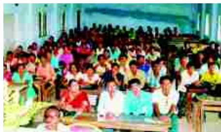
"All Ears" : the students attending the seminar