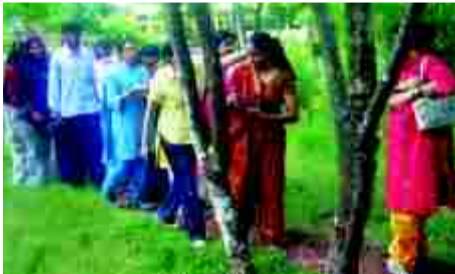
SITD Bhopal students on a trip to learn about medicinal plants