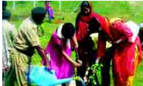
SITD Bhopal Students planting saplings