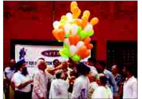
For the Gandhi of our minds: Students of Chandigarh SITD at the Old Age Home