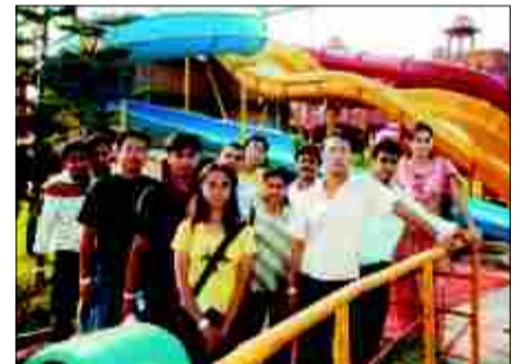
Sharing some cheerful moments: The Staff of SITD, Assam on a Tour