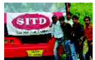
"We had a blast"

The SITD students (CTTC) of Bundi had fun and frolic while on the excursion at the queen of Hadoti. Beyond the hurly-burly, they all had a chance to learn more about the historical spots of Bundi. The Taragarh Fort or 'Star Fort' is the most impressive of the city's structures. The Bundi Palace is situated on the hillside adjacent to the Taragarh Fort and is notable for its lavish traditional wall