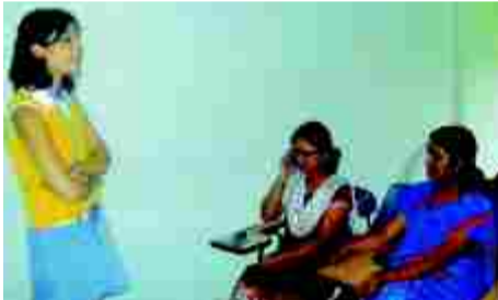
SITD Bhopal students participating in a live radio programme with the Radio Jockey of Big FM

Several events, yet entirely different proved a practice ground for the pupils of SITD, Bhopal. The centre in Bhopal organized several wonderful events that helped the students to develop their talents. Their skills of creativity were put to test through a poster making competition and various other programmes. It was lively than any other programme, more so with the live show of Big FM in Bhopal. As SITD has always believed in environmental conservation and in a healthier co-existence with nature, such programmes were initiated as those that cater to instill the love for nature. The seminar on Reiki conducted by the centre was a new positive experience for the students. A study on medicinal plants was also conducted and it was a training ground for the students to improve their knowledge in planting and protection of natural resources.