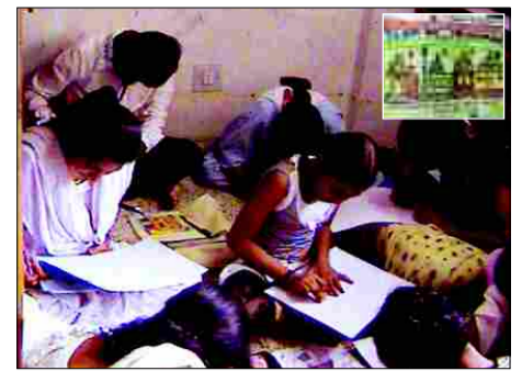
Creativity Unleashed: The painting competition held as part of the Social Service Day in Surat, Gujarat. The topper's painting is in the inset.