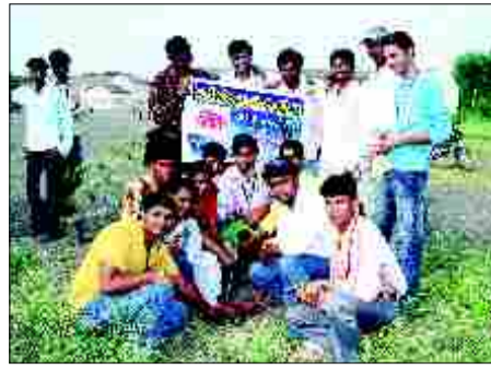
Capturing the right spirit of Gandhi Jayanthi: Students of SITD Bhavnagar, Gujarat