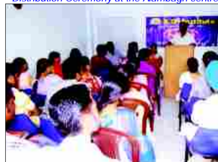
Being attentive: The students at the Career Counselling Camp organised by SITD, Chandigarh