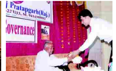
Honouring the Minister, Shri. Nanad Lal Meena