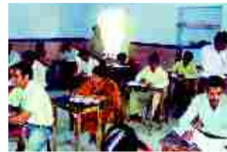
CTTC students of SITD, Jaipur attending the examination

The exam for the CTTC students was conducted in the Jaipur centre of SITD. It proved to be a great success with the smooth conduct of the exam and the enthusiastic participation of the students.