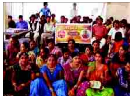
All colours for the Navratri: Students of SITD Gujarat in bright attire for the occasion