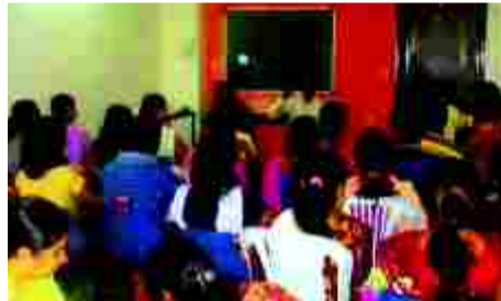
SITD Bhopal Students attending a seminar on Reiki