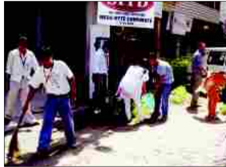
Imbibing the Gandhian principles: Students of SITD Assam at work