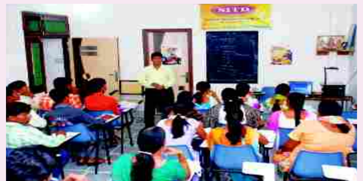
SITD Rajasthan students attending the seminar

The pupils of the In-Tech Computers in Asind, Rajasthan were provided with the best information and training on Hardware and Networking when a seminar on the same was conducted by SITD. The students revealed that the seminar provided such informative news that they could learn from nowhere else. Encouraged by the idea, the students are already thinking of new directions in their choice of a possible career.